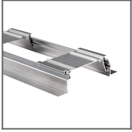
RAM-KOZE-100 Profile Ref: 18057