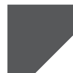
End Cap (E)