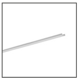
PROTECTIVE INSERT TECH-10 C24533C02