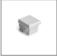
M-K grey End cap Ref: 24216