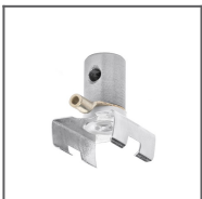
ZZ Head Ref: 42218