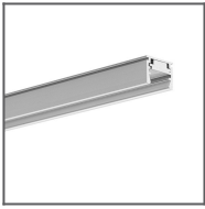
REGULOR Profile Ref: B468+43