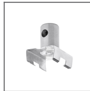
ZO Head Ref: 42217