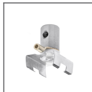
ZZ Head Ref: 42218