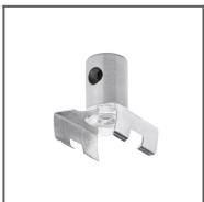
ST Head Ref: 42216