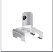
45-ST Head Ref: 42210