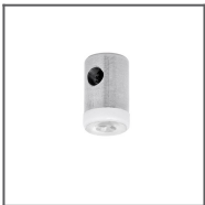
BZP-ZO Head Ref: 42214