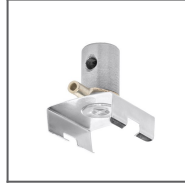
45-ZZ Head Ref: 42212