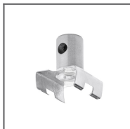
ZO Head Ref: 42217