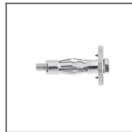
C3 Fastener Ref: 42105