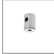
BZP Head Ref: 42213