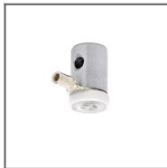
BZP-ZZ Head Ref: 42215