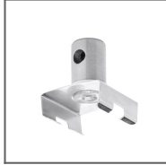
45-ZO Head Ref: 42211