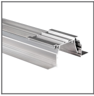
RAM-KOZE-50 Profile Ref: 18055